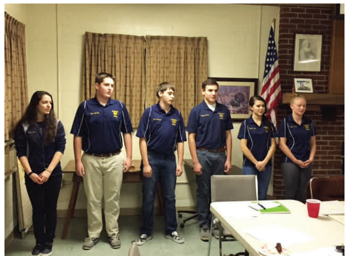
AF-IWLA The new board of directors for the Junior Chapter are sworn in

IWLAF has begun a junior chapter. What is a junior chapter? Well it is just like the regular chapter but it is run by young adults that are still in high school. This new junior club will have its own officers and directors, conduct regular board meetings and make decisions on their own on the different projects that they would like to accomplish at our club. Do you have a young one looking for leadership experience? Someone who wants to make a difference in the community and follow the Izaak Walton Pledge to conserve our environment? Consider having them join our brand new junior chapter. More information will become available in the next news letter